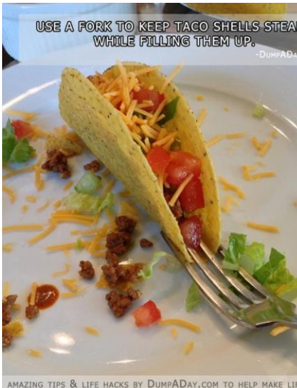
AMAZING TIPS & LIFE HACKS BY DUMPADAY.COM TO HELP MAKE LIFE EASIER

USE A FORK TO KEEP TACO SHELLS STEADY WHILE FILLING THEM UP. -DumpADay.com