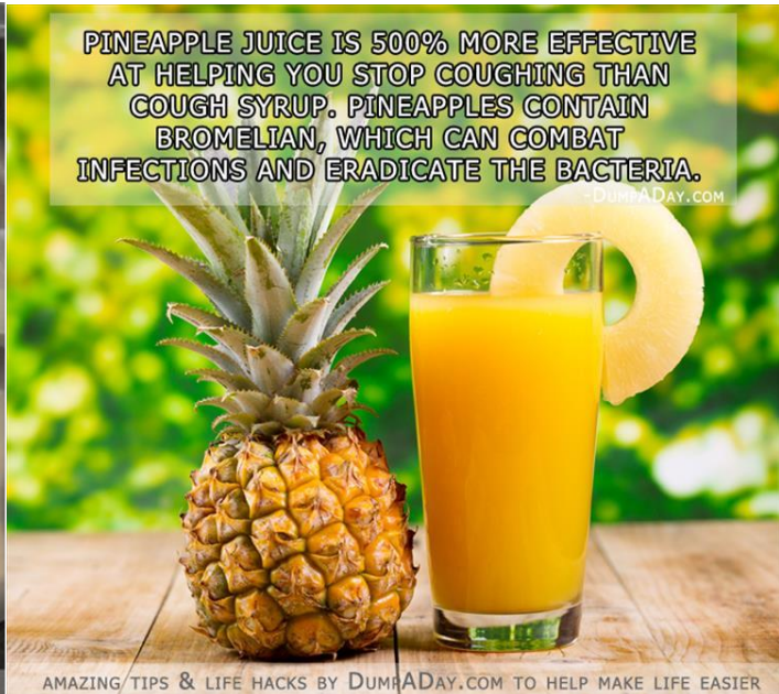
AMAZING TIPS & LIFE HACKS BY DUMPADAY.COM TO HELP MAKE LIFE EASIER

PINEAPPLE JUICE IS 500% MORE EFFECTIVE AT HELPING YOU STOP COUGHING THAN COUGH SYRUP. PINEAPPLES CONTAIN BROMELIAN, WHICH CAN COMBAT INFECTIONS AND ERADICATE THE BACTERIA. -DumpADay.com