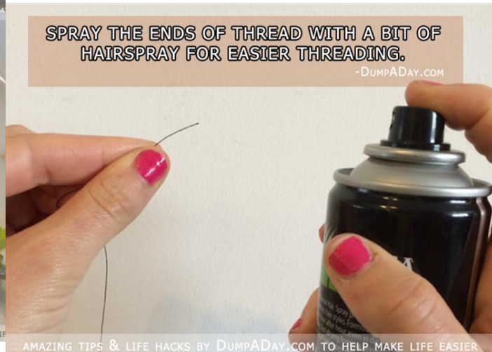
AMAZING TIPS & LIFE HACKS BY DUMPADAY.COM TO HELP MAKE LIFE EASIER

SPRAY THE ENDS OF THREAD WITH A BIT OF HAIRSPRAY FOR EASIER THREADING. -DumpADay.com