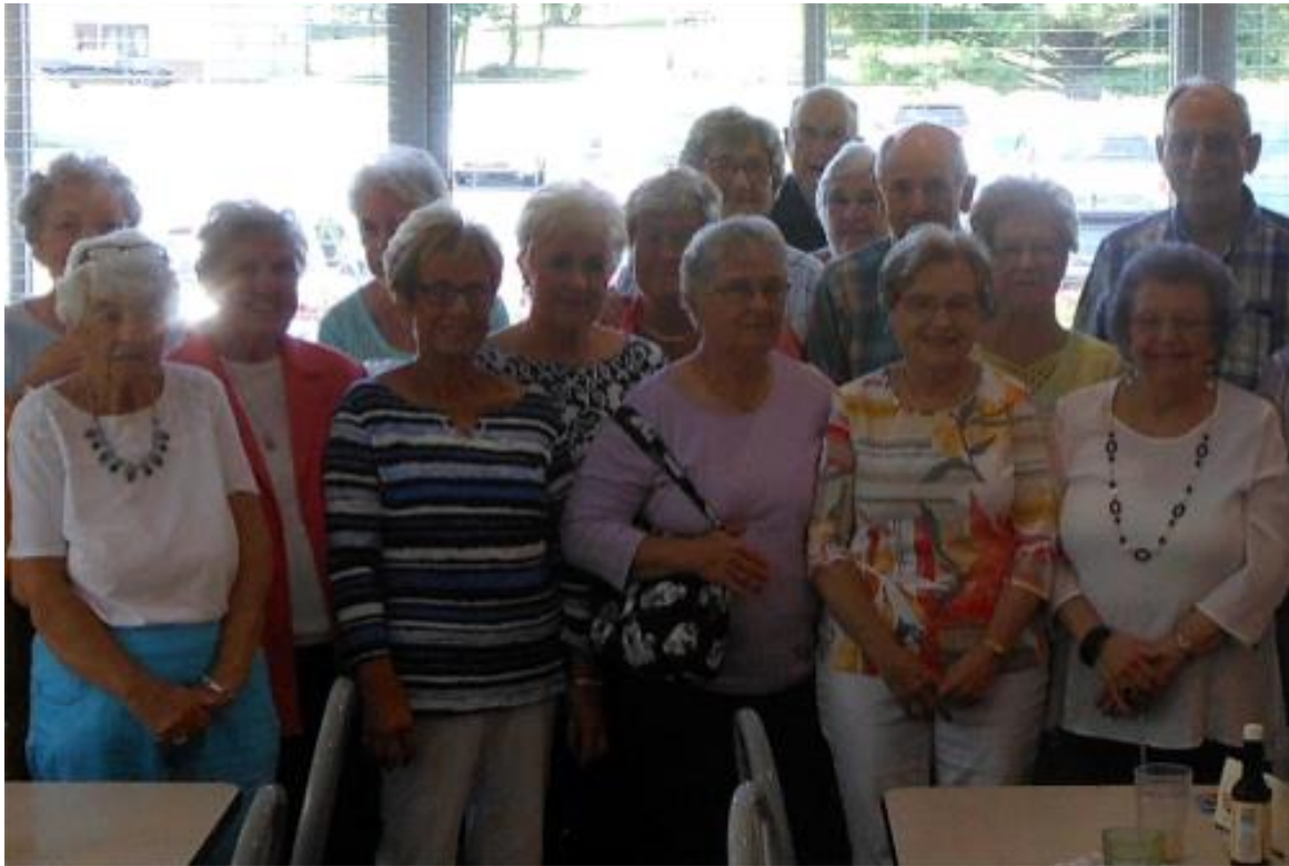
We also enjoyed visiting with the “youngsters” from the Class of '58!