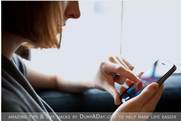
AMAZING TIPS & LIFE HACKS BY DUMPADAY.COM TO HELP MAKE LIFE EASIER

IF YOU'RE IN AN AREA WHERE YOU SHOULD HAVE CELL PHONE SERVICE BUT DON'T, PUT YOUR PHONE ON AIRPLANE MODE AND THEN SWITCH BACK. THIS WILL CAUSE YOUR PHONE TO REGISTER AND FIND ALL THE TOWERS IN THE VICINITY. -DumpADay.com