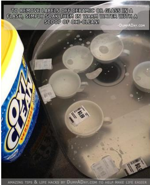
AMAZING TIPS & LIFE HACKS BY DUMPADAY.COM TO HELP MAKE LIFE EASIER

TO REMOVE LABELS OFF CERAMIC OR GLASS IN A FLASH, SIMPLY SOAK THEM IN WARM WATER WITH A SCOOP OF OXI-CLEAN! -DumpADay.com