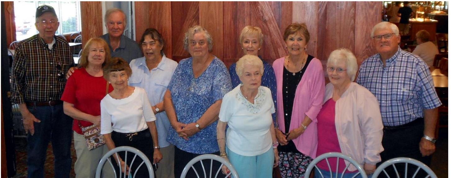
Remember, no picnic in September because we are having our 80 th Birthday Bash!