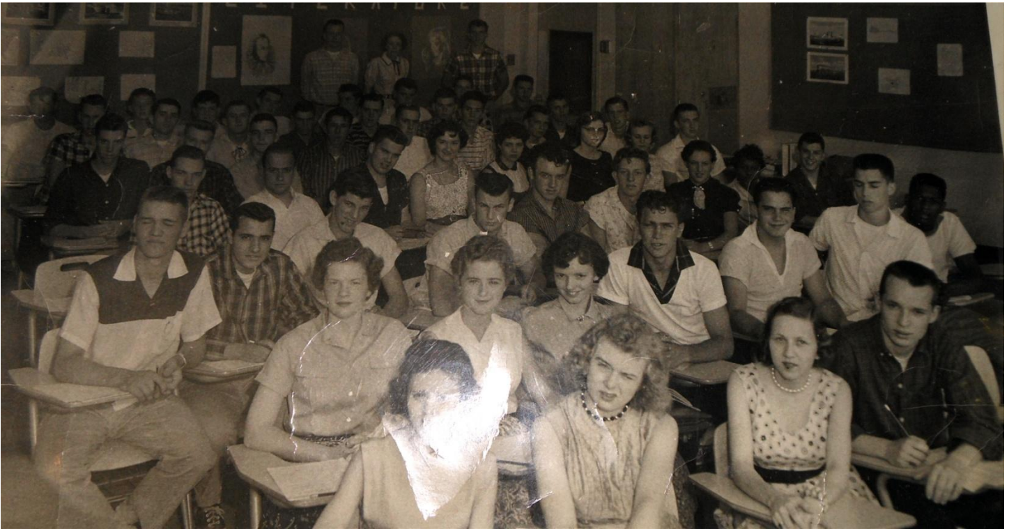
What a Mob!