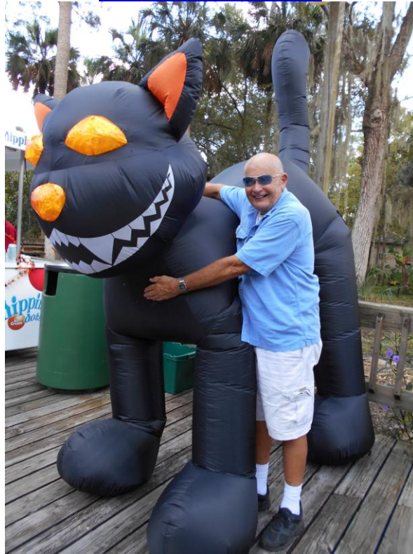
Still trying to grow up.