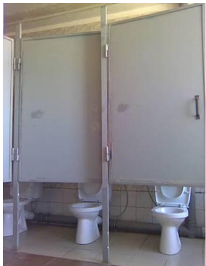
Face hidden all else is okay?