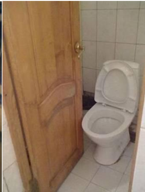
Should have measured twice!