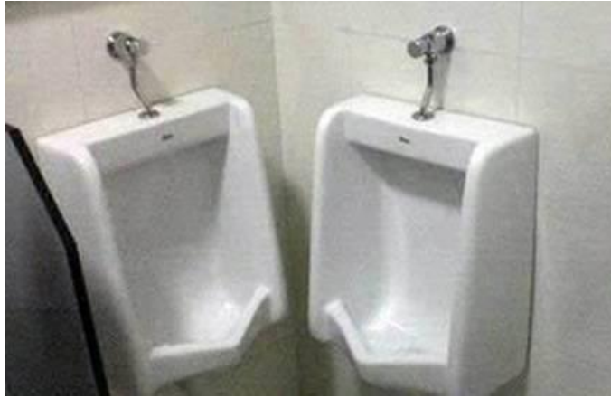
For close friends only I guess