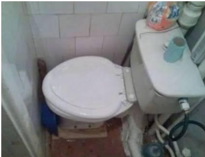
"Half bath" in the real estate listing?