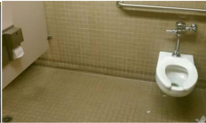
For people that have arms like an Orangutan..