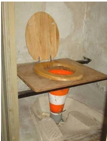
Oak seat is a nice touch.