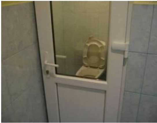
Purpose of door?