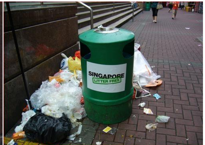
FRIENDS OF IRONY