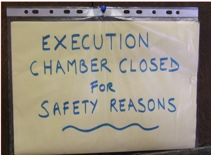
FRIENDS OF IRONY