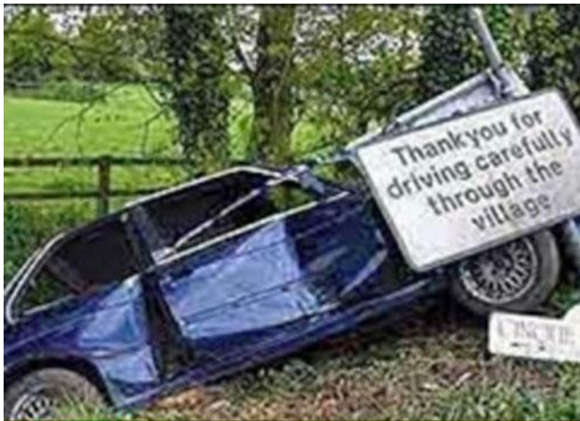
FRIENDS OF IRONY