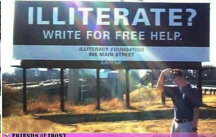
FRIENDS OF IRONY