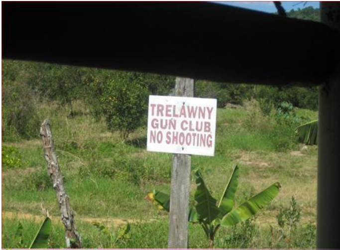
FRIENDS OF IRONY