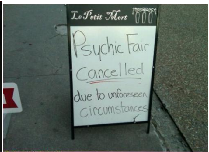
FRIENDS OF IRONY