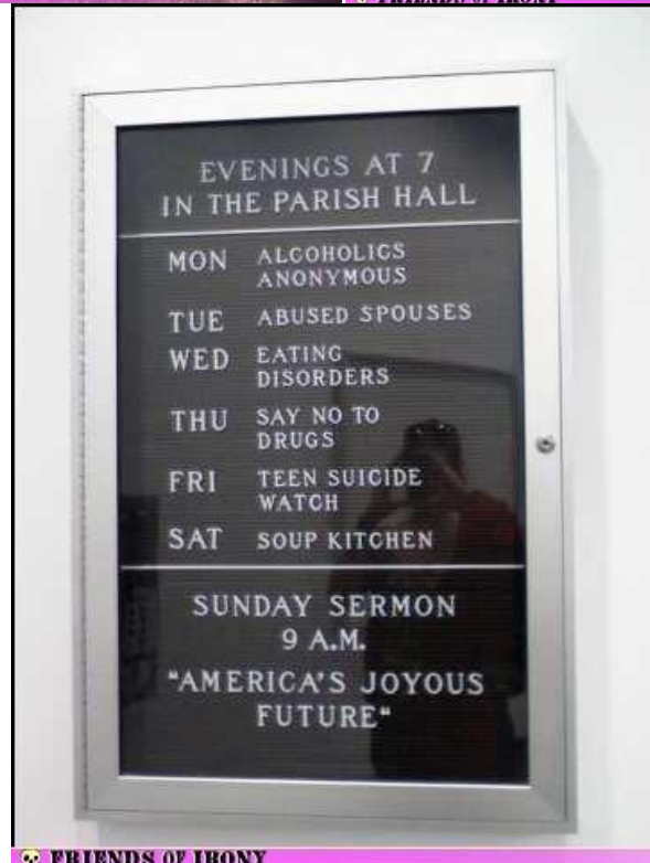
FRIENDS OF IRONY