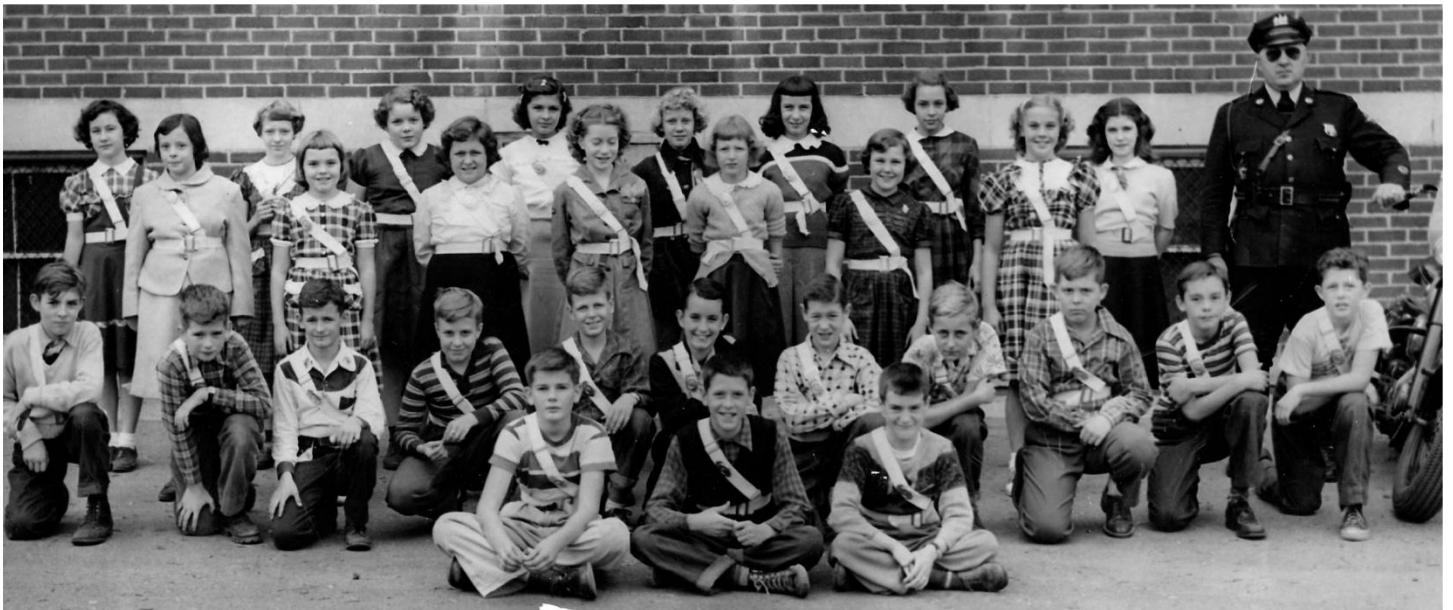
Broadway Patrol circa 1950-How many can you ID?