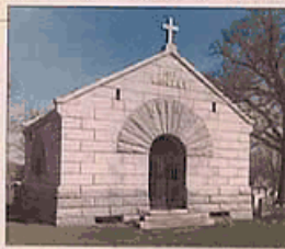
The Lantry mausoleum was not until it was demolished that workers found a cache of caskets in the foundation.

The caskets were found in the foundation of the mausoleum, a monthly report last year of dirt removed from the site.