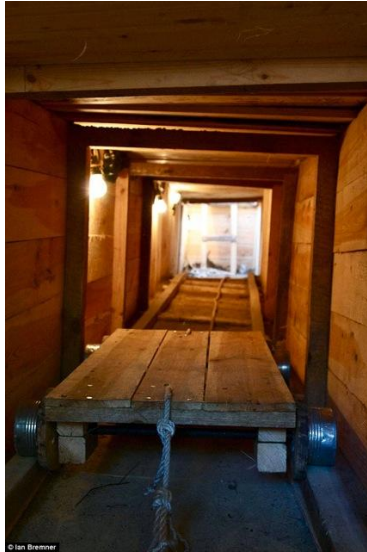
Tunnel vision: A tunnel reconstruction showing the trolley system.

It was on the night of March 24 and 25, 1944, that 76 Allied airmen escaped through Harry. Barely a third of the 200 prisoners - many in fake German uniforms and civilian outfits and carrying false identity papers - who were meant to slip away managed to leave before the alarm was raised when escapee number 77 was spotted.