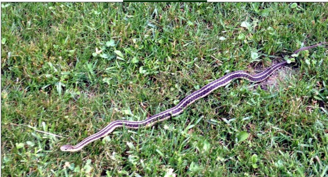
Bob's pet garter snake, "Slinky."