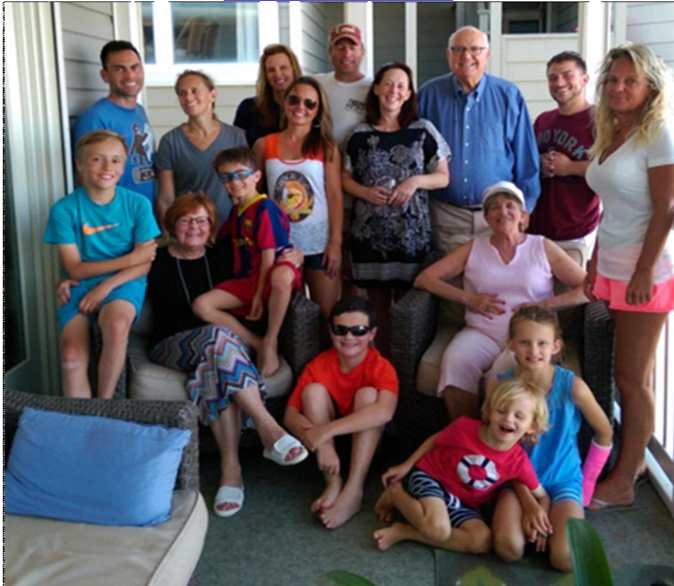
Family reunion at beach house in Ocean City MD.