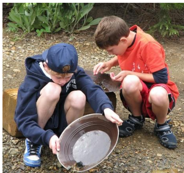
Rafting on the Arkansas River and the Grandsons NOT finding gold.