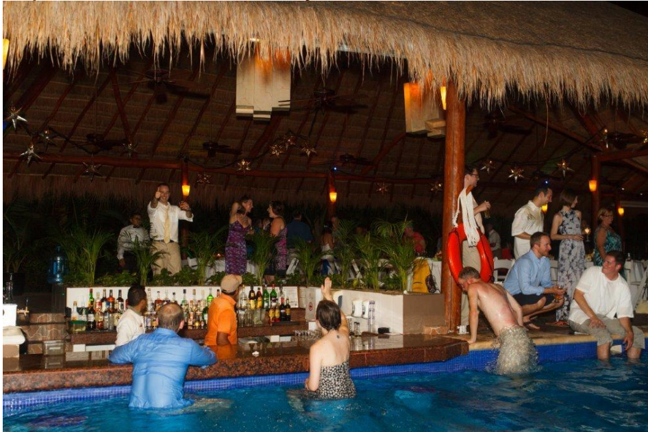
(Too Much Corona?)